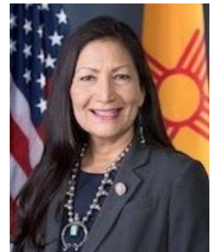
US Rep. Debra Haaland