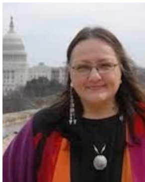
Suzan Harjo Native Rights Advocate